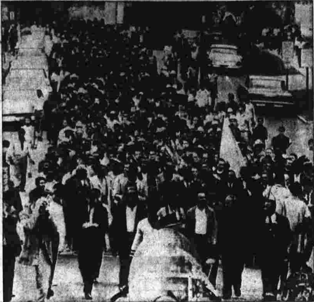
Marching Behind Dr. King

(Continued from Page One) people to "respond fairly in accordance with our traditional reliance upon law and order." The judge ruled on a petition of civil rights leaders after the March 7 march was broken up.